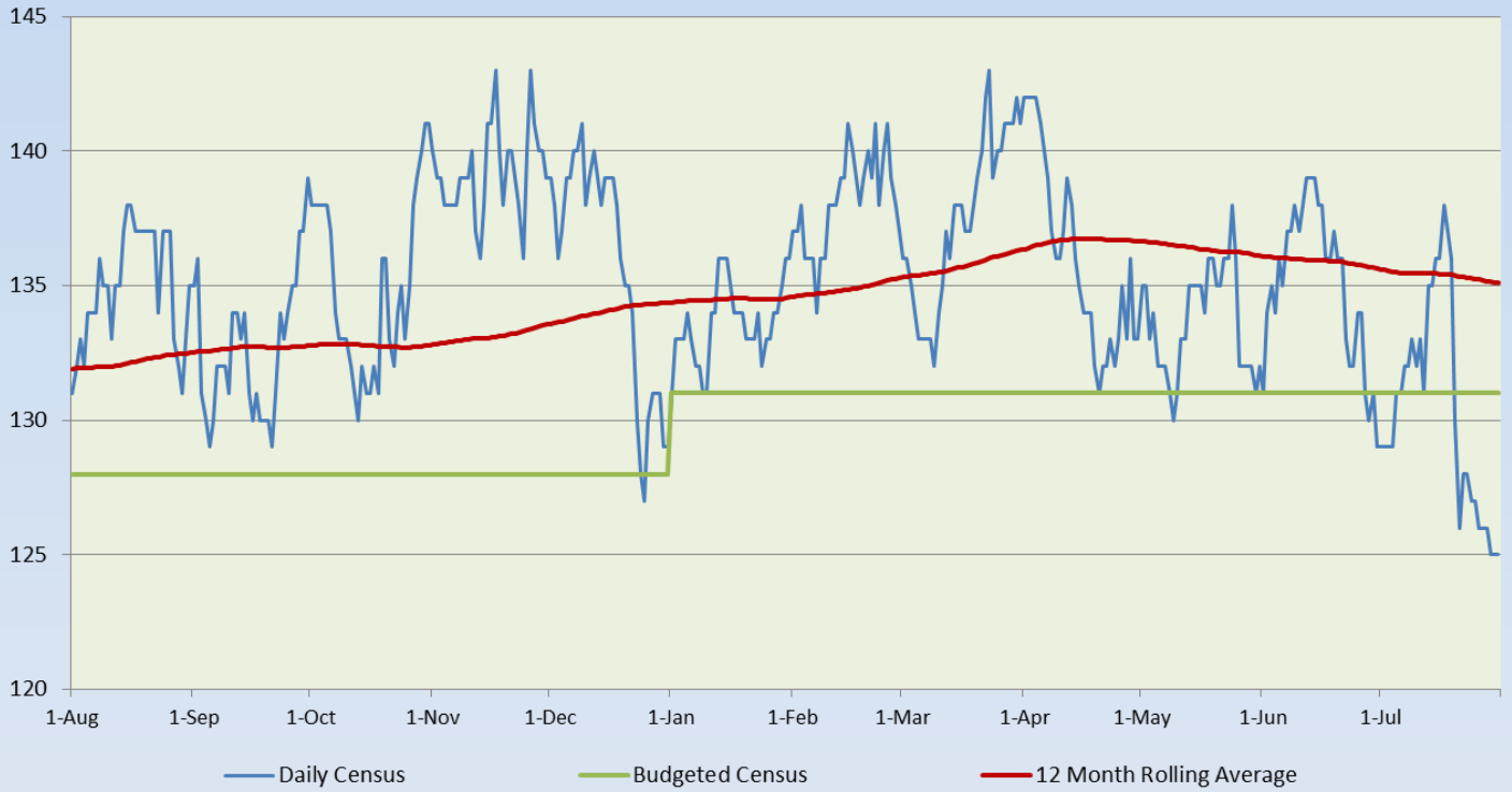
ROCKY KNOLL DAILY CENSUS AUGUST 01, 2016 THROUGH JULY 31, 2017