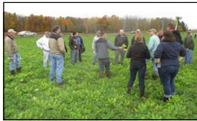
Sheboygan Co. Cover Crop Field Day

Response: In the fall of 2011, Mike provided leadership for initiating cover crops research in Sheboygan County. UW-Extension cover crop research & education aims to expand the acreage of cover crops planted, while highlighting the physical, chemical, biological, and economic benefits of using cover crops in Wisconsin's cropping systems.